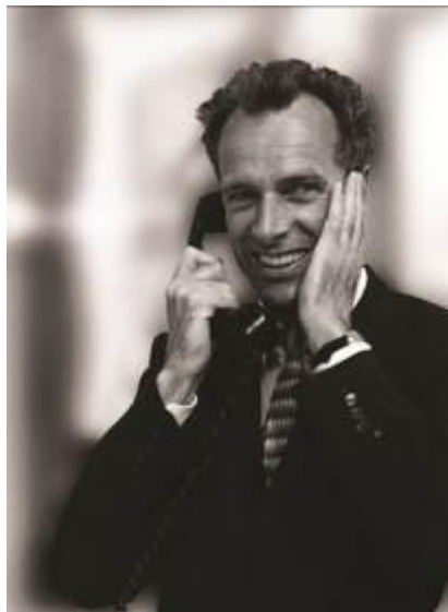
Ernst Beyeler (1921-2010)

All Sale Proceeds Will Benefit The Fondation Beyeler in Basel, Switzerland